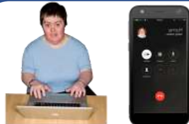
On the internet or the phone.