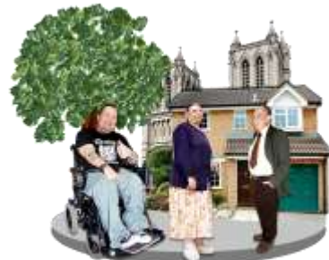
In your community.