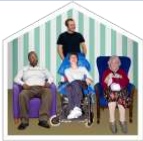
In a care home.