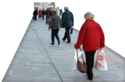
In the street.