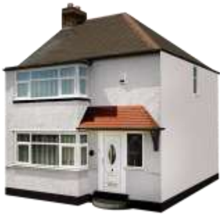
In your home.