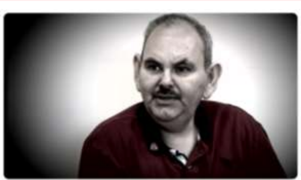
Hate Crime Prevention at Future Directions CIP

At the meeting, there was a discussion about Community Employment. People spoke about how they did not feel safe in their community.