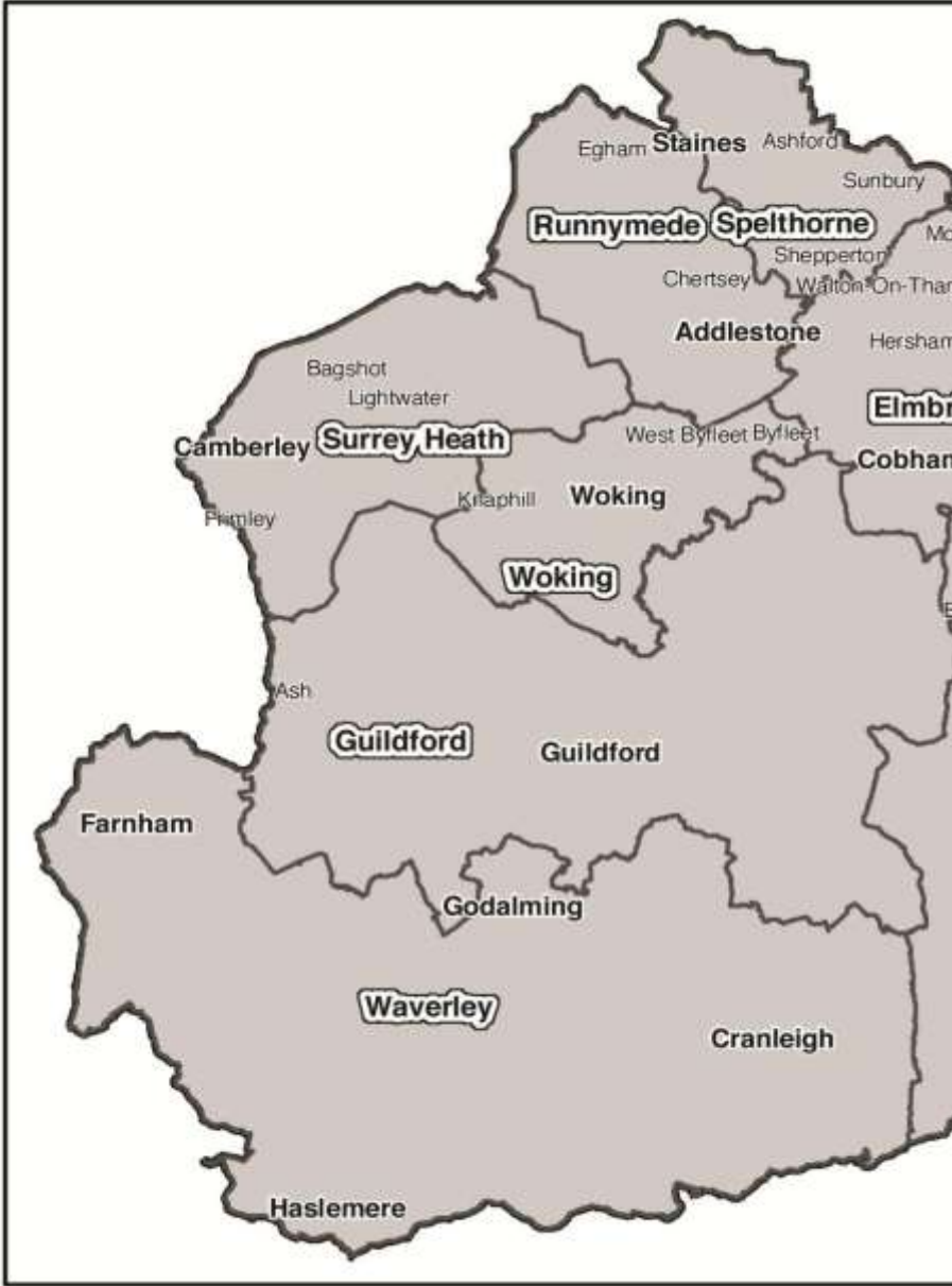
Surrey map .....28