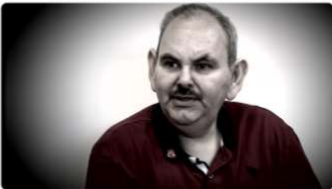
Hate Crime Prevention at Future Directions CIC

At the meeting, there was a discussion about Community Employment. People spoke about how they did not feel safe in their community.