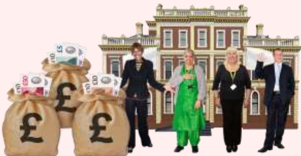
Hate Crime Awareness at Future Directions (SP)

The people in the video, got money from the local council to set up their own Safe Place scheme.